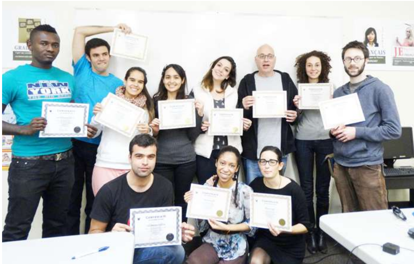
Students Graduation from CCE in Toronto