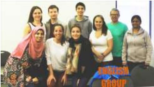
ESL Classes at CCE